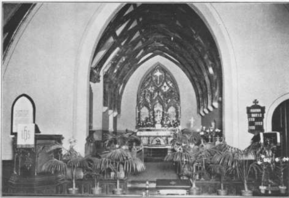
VIEW OF PRESENT CHANCEL.